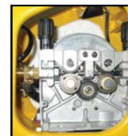
Standard 2 Roll Drive Optional 4 Roll Drive